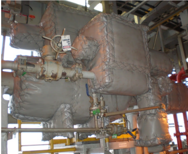
Valves, actuators, and instrumentation