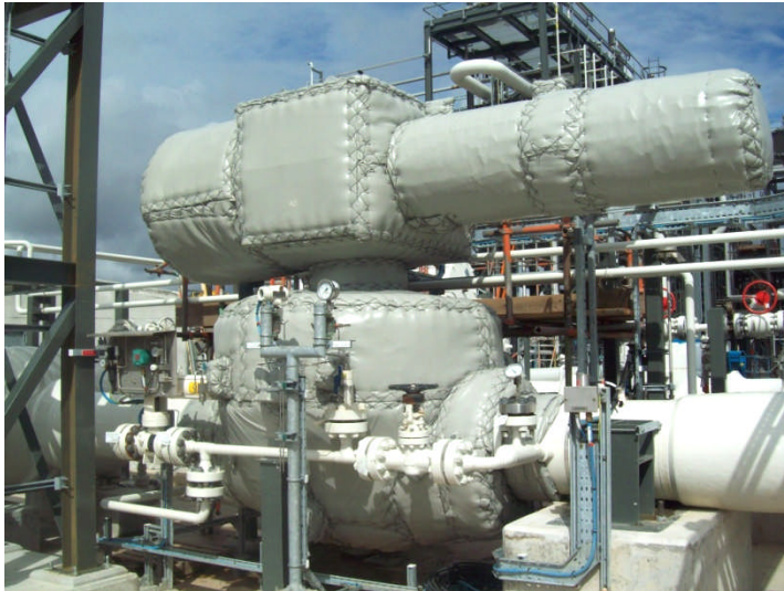
Valves and actuators