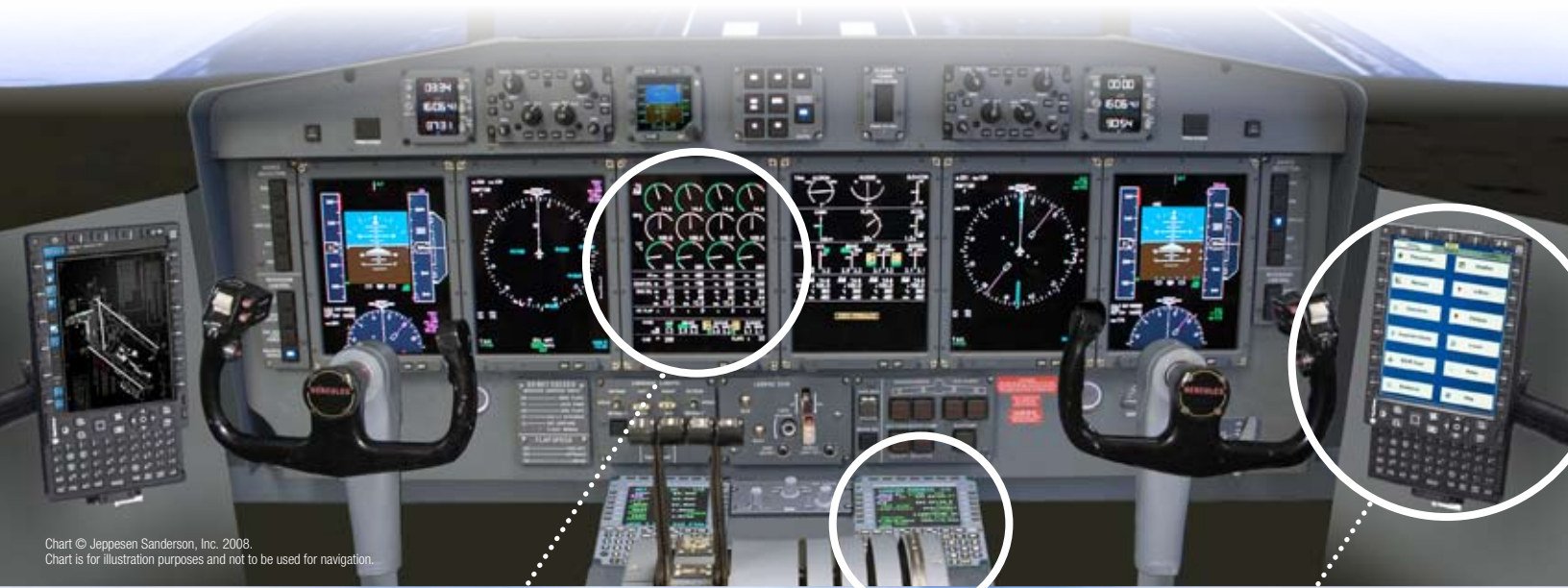
Chart © Jeppesen Sanderson, Inc. 2008. Chart is for illustration purposes and not to be used for navigation.